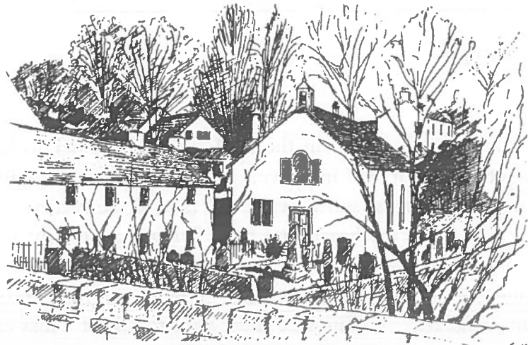
Kirkmichael Parish Church 1791-1991